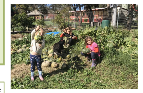
Community Garden Pumpkin Picking Day